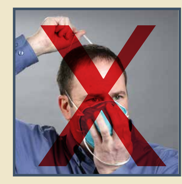
DO NOT TOUCH the front of the respirator! It may be contaminated!