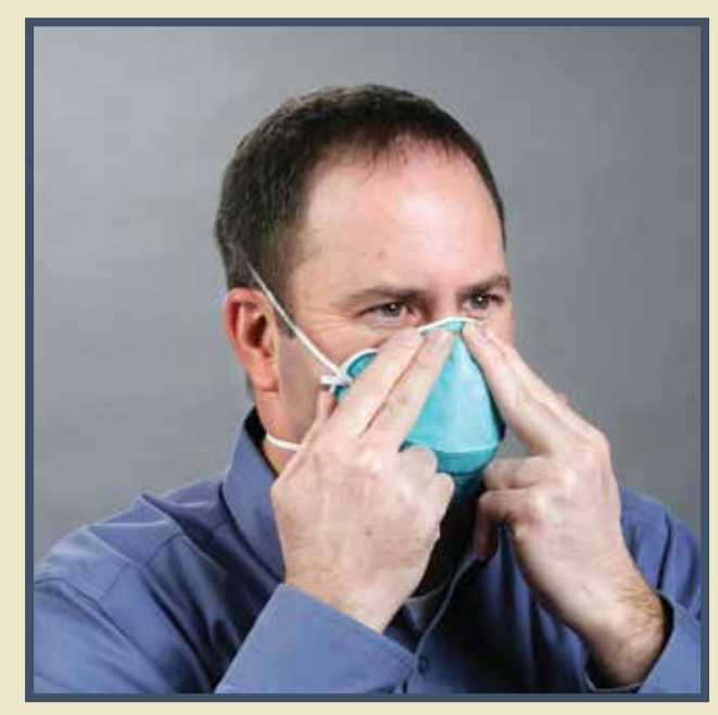
Place your fingertips from both hands at the top of the metal nose clip (if present). Slide fingertips down both sides of the metal strip to mold the nose area to the shape of your nose.