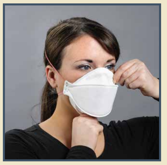
If air leaks around the nose, readjust the nosepiece as described. If air leaks at the mask edges, re-adjust the straps along the sides of your head until a proper seal is achieved.