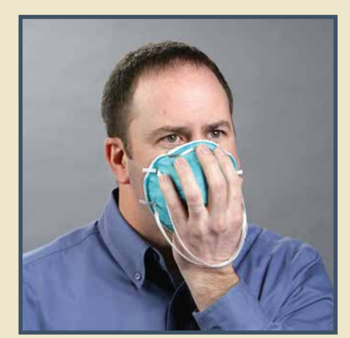
Cup the respirator in your hand allowing the headbands to hang below your hand. Hold the respirator under your chin with the nosepiece up.