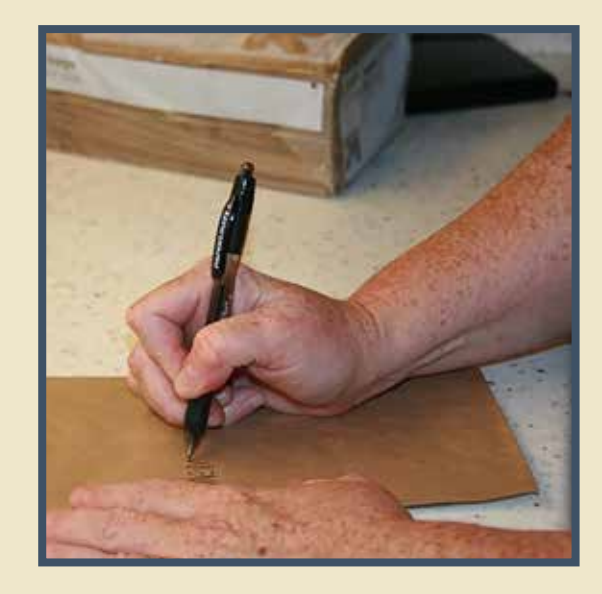
Get paper bag, write your name and date on bag. Confirm with Supervisor and location on where to store N95