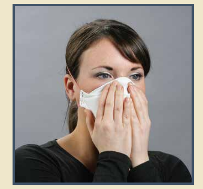
Place both hands completely over the respirator and exhale. If you feel leakage, there is not a proper seal.