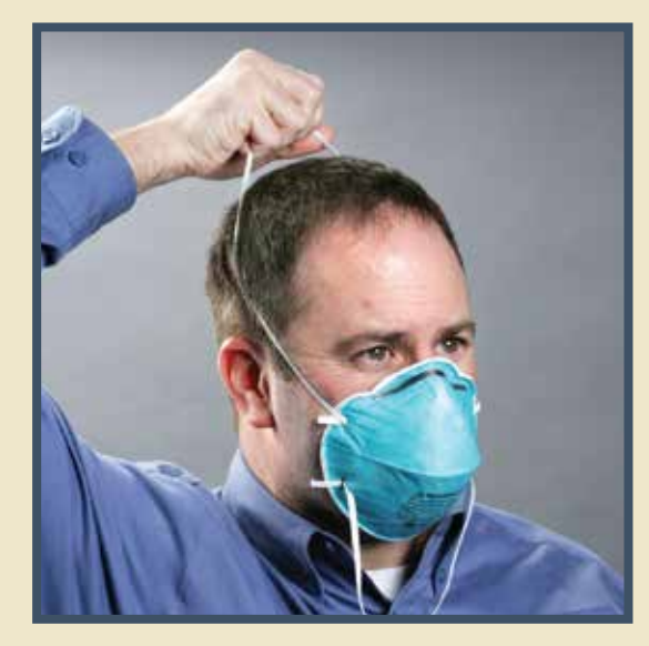
Remove by pulling the bottom strap over back of head, followed by the top strap, without touching the respirator.