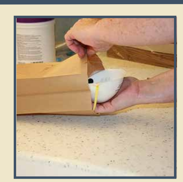
Insert N95 for later reuse. WASH YOUR HANDS!