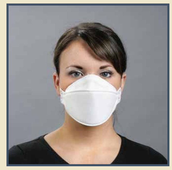
If you cannot achieve a proper seal due to air leakage, ask for help or try a different size or model.