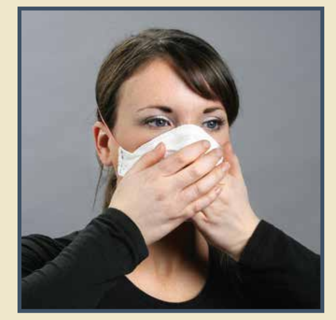
Place both hands over the respirator, take a quick breath in to check whether the respirator seals tightly to the face.