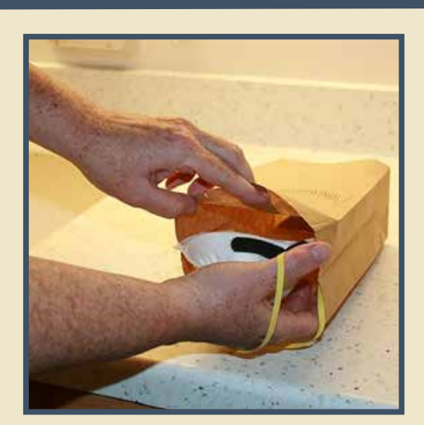
After 72 hours, remove N95 from bag, being careful not to touch inside of mask. Write the date of reused (max 5x)

During a national pandemic, State Security Agency complies with the OSHA Volunteer Respiratory Protection Standard, 29 CFR 1910.134 It is not required but will provide respirators to employees who wish to use them while at work. Confirm with Supervisor specific location requirements and procedures.