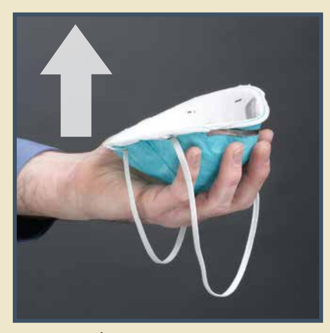
Position the respirator in your hands with the nose piece at your fingertips.